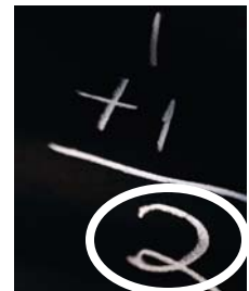
Make Conclusions _____