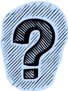
Identify the Question _____