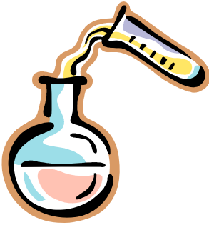
Perform Experiments _____

Place the steps of the scientific method in the correct order, using the numbers 1-6